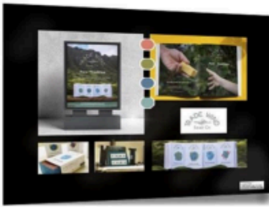
[comprehensive campaign Mounted submission for exhibition]