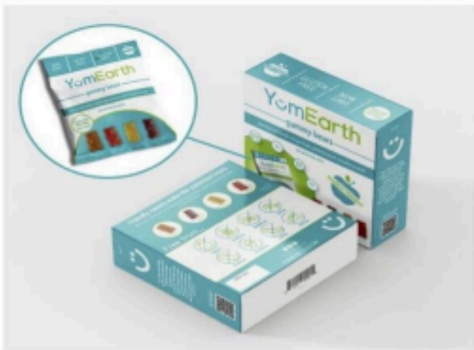
[product packaging with inset ]