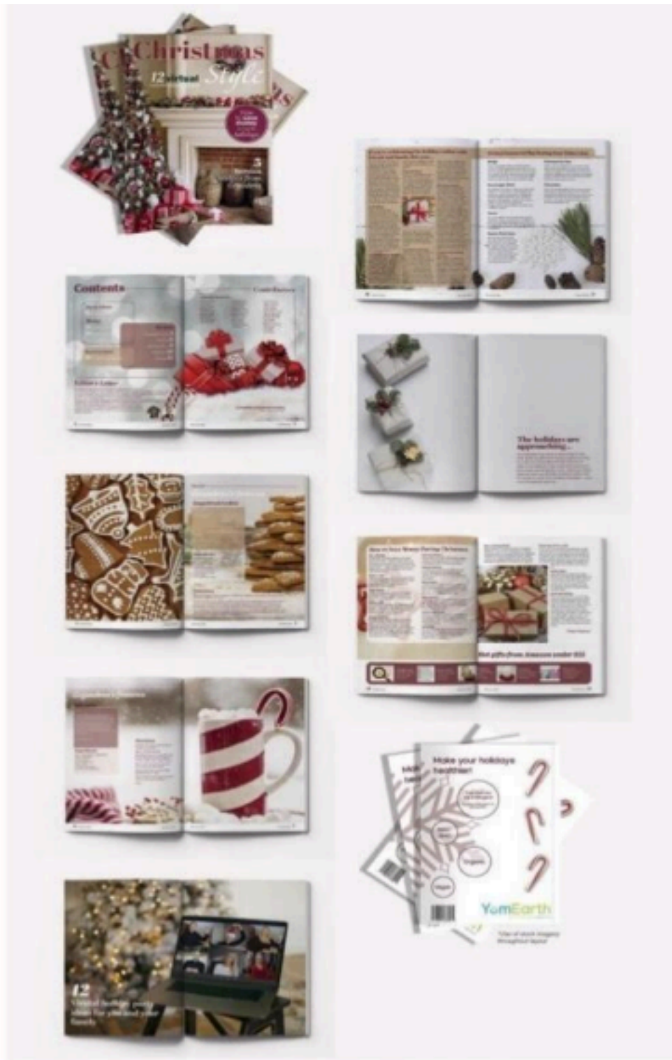
[magazine comp/mockup in photoshop]