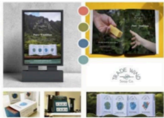
[comprehensive campaign digital submission for WEBPAGE]