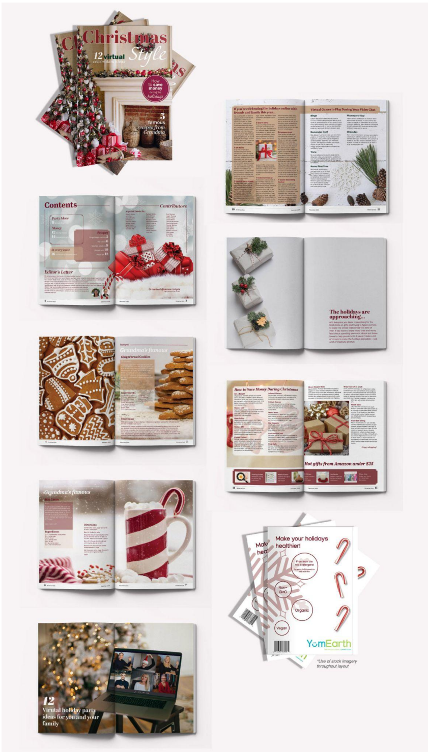
[magazine comp/mockup in photoshop]