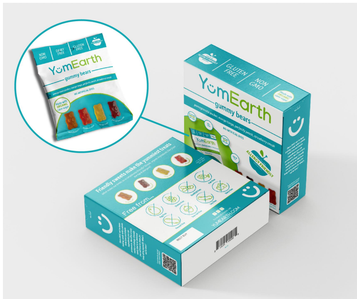
[product packaging with inset]